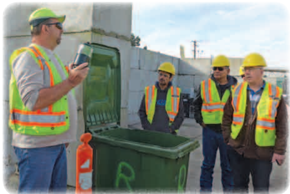
Training Tour at North Shore Transfer Station, March 2018