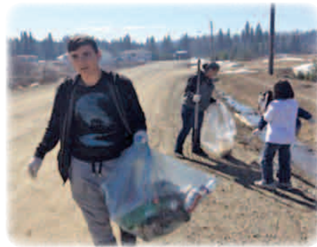
Clean-up around JMJ school, April 27. Students and staff used the Toolkit and collected refuse to be sorted later into recyclables, refundables and garbage.