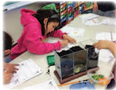
JMJ School students observing the decomposition process of different materials using the See-Through Compost Container

Indigenous Services Canada began the B.C. First Nations Zero Waste Program in 2008 after an assessment showed that the communities have similar needs and challenges. A common theme is the desire for recycling, composting and waste reduction activities. Solutions are developed locally and in cooperation with many different Regional Districts, product stewards and service providers.