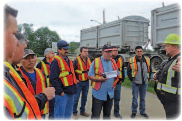
Training at Ecowaste Richmond Landfill, May 2018