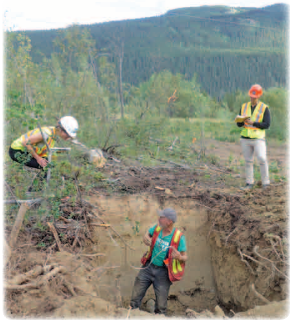
Telegraph Creek EcoDepot Site Preparation, July 2018